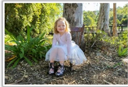
Botanical Gardens, Benowa (Above) Pizzey Park, Miami (Below)